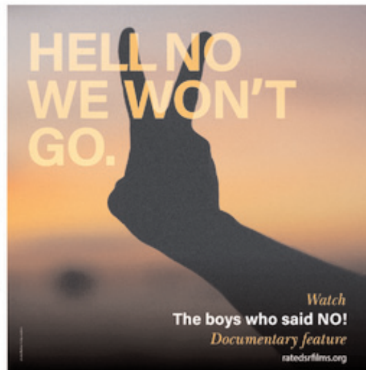
Watch The boys who said NO! Documentary feature ratedsrfilms.org