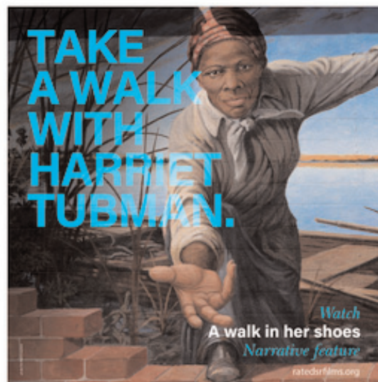
Watch A walk in her shoes Narrative feature ratedsrfilms.org