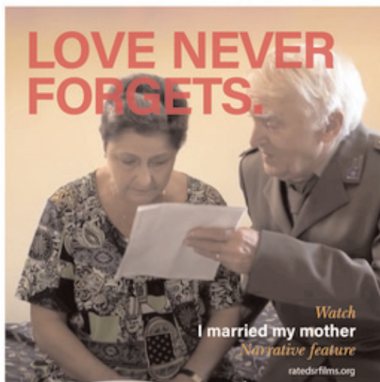
Watch I married my mother Narrative feature ratedsrfilms.org