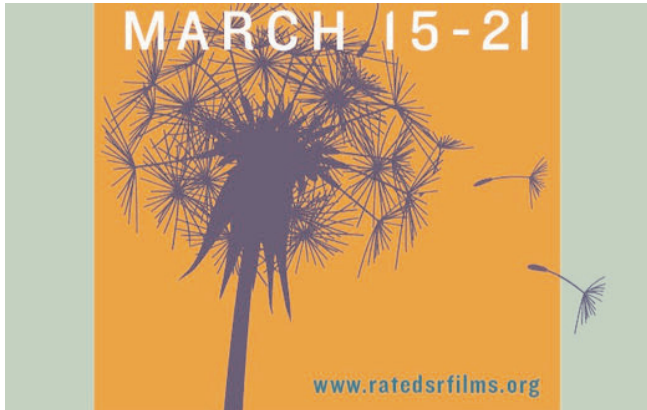
SRFF2021 Logo

"If we dream alone, it's only a dream. If we dream together, it becomes a reality." - African Proverb