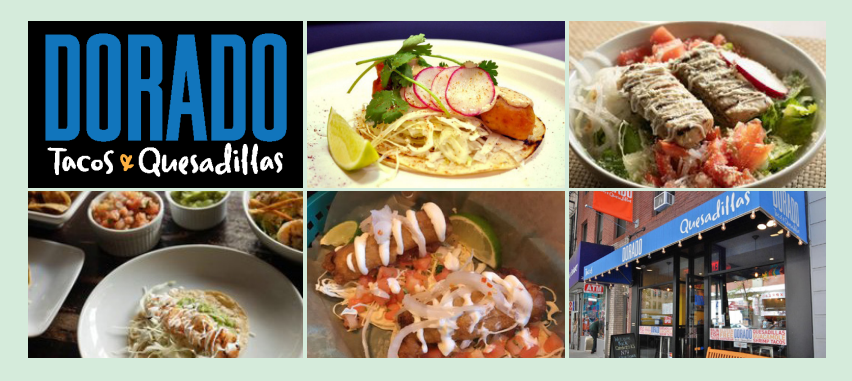
BAJA CALIFORNIA STYLE MEXICAN 28 E I2th St, New York, NY 10003 Right next to the Cinema www.doradotacos.com/

An eye-opening documentary, The Creepy Line reveals the stunning degree to which society is manipulated by Google and Facebook and blows the lid off the remarkably subtle – hence powerful – manner in which they do it.